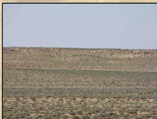
Mongolian khulans in the Tsagaantsav area. 2010.

Involvement of the Director of a watermelon and vegetables growing company, located in the Tsagaantsav area, in the southeast Gobi, as Ranger volunteer of GOVIIN KHULAN. Summer 2012.