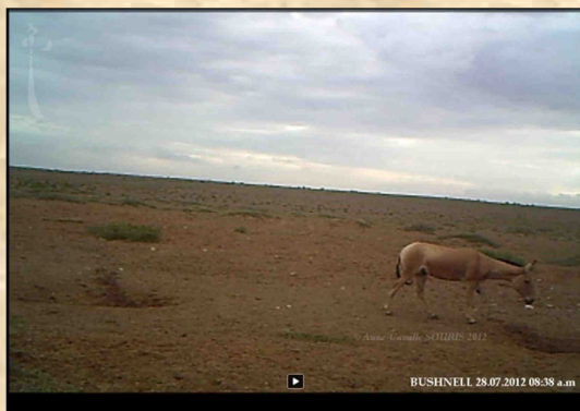
Mongolian khulan (male) drinking at a watering hole made at a dry river bed, in the morning: 08:00 a.m. Image captured from a video obtained with a trail camera BUSHNELL. Observation by using cameras.

Our multidisciplinary and innovative approach includes: