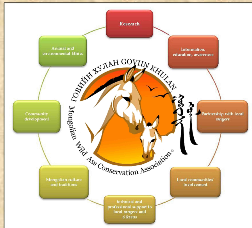
General concept for protection of the Mongolian Khulan and its habitat on a long term basis

Further topics of research and actions will be added within the following months, and will be mentioned in our website.