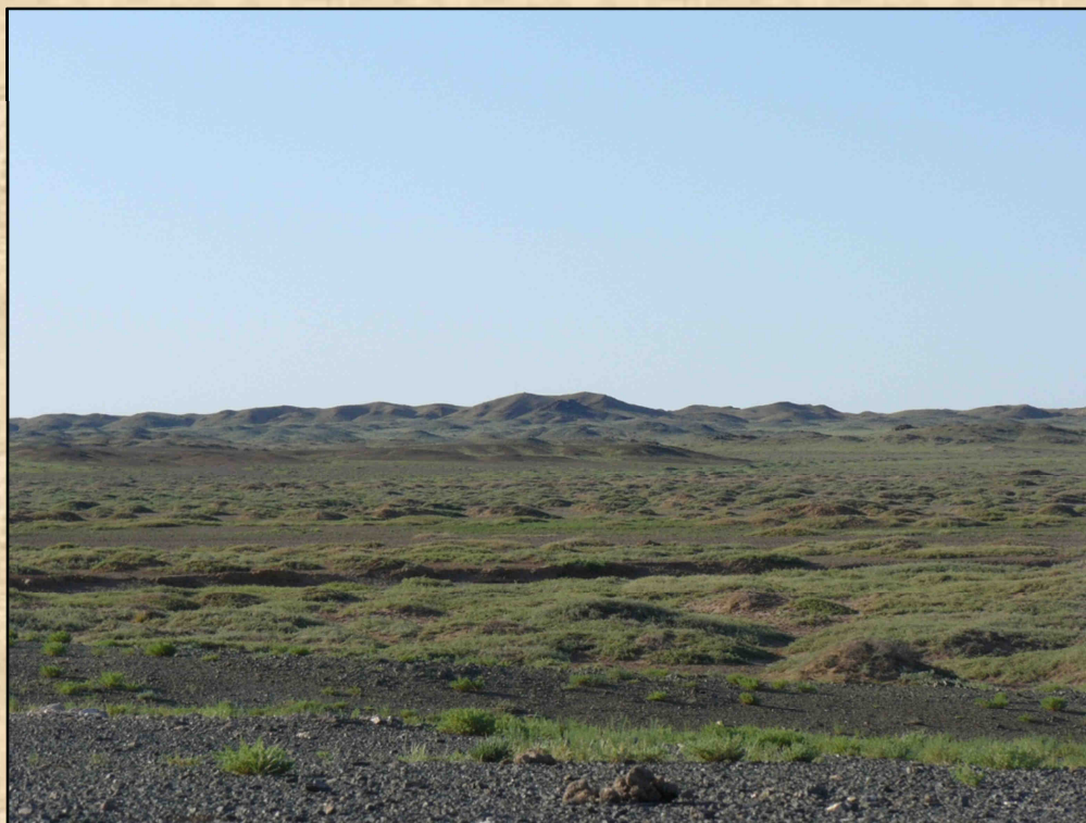
Landscape of the southeast Gobi, summer 2008

Since the summer 2008, the conservation program is conducted in the south of Mongolia, in the eastern part of the Ömnögobi aimağ/province and in the south of the Dornogobi aimağ/province, located in the southeastern Gobi. It will be maybe extended to Inner Mongolia (China) in the near future where small populations of the Mongolian Khulan are also present (but for which it is still not known if these populations are permanent or if they are the result of migrations from Mongolia).