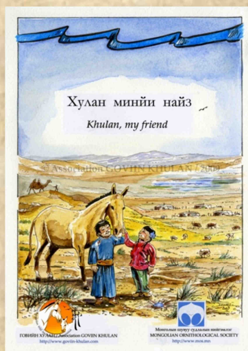
Cover of a strip cartoon created in 2009 for the local population. “Khulan my friend”. This strip-cartoon had a great success in the Gobi area.