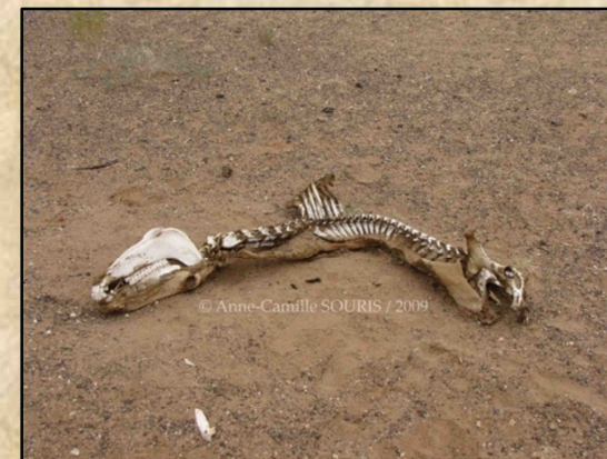
Carcass of a Mongolian Khulan illegally hunted, summer 2009.

1.4. Research on illegal hunting and other threats affecting this sub-species survival and their impact on the Khulan population dynamic (direct observations, by using cameras, interviews of local people, surveys ...).