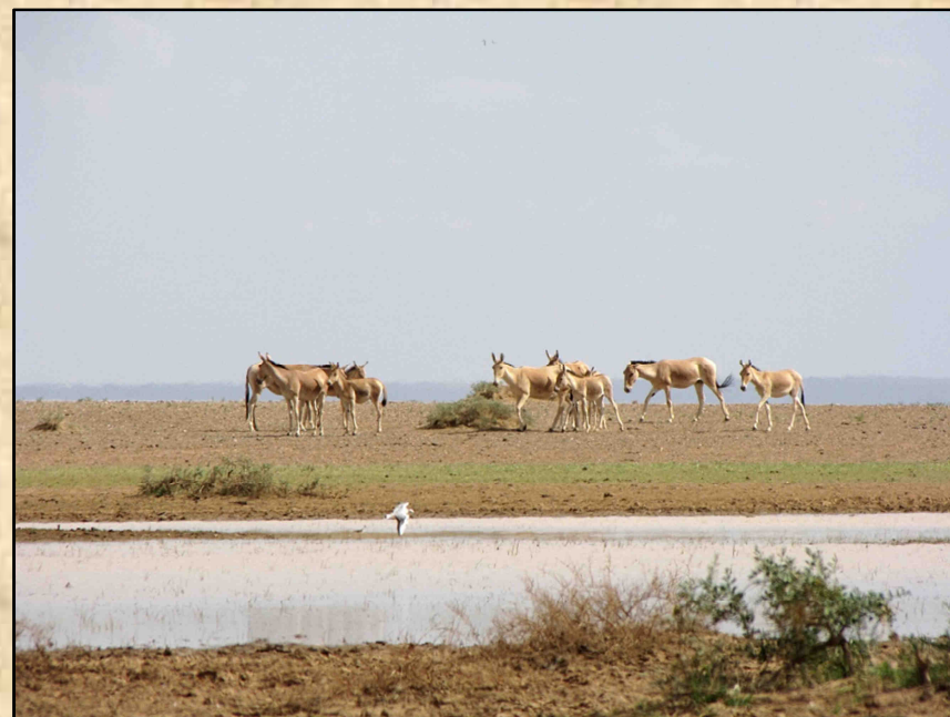
Mongolian Khulans at a small pool of water (temporary) _ Summer 2009.

Internationally, the Mongolian Khulan is listed in the Red List of the IUCN as “ Endangered ”, in Appendix I of the CITES (Convention on International Trade in Endangered Species of Wild Fauna and Flora) and in Appendix II of the CMS (Convention on the Conservation of Migratory Species of Wild Animals). Locally, the Mongolian Khulan is listed in the Mongolian Red Book as “very rare” and as “Endangered” in the Mongolian Red List of Mammals.