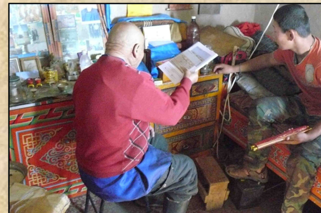
Buddhist monks of the Ulgii Khiid monastery, the morning during which they made the Mongolian Khulan sacred following Buddhism teaching and traditions.

In 2012, our team donated a brochure about Mongolian Khulan and biodiversity conservation created by our organization, and some materials (books, posters...) created by 2 American organizations (The Tributary Fund and the Arc World project with which we are in touch and that also work to reinforce links between religion and biodiversity conservation).